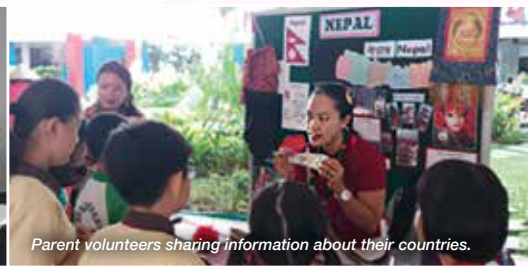
Parent volunteers sharing information about their countries.