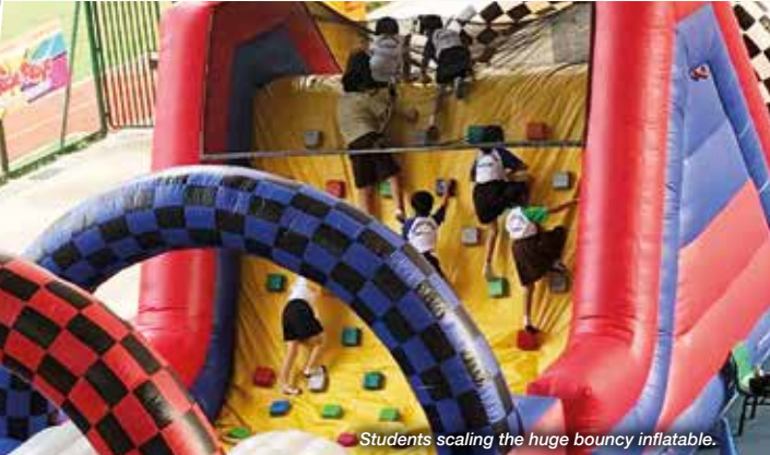
Students scaling the huge bouncy inflatable.