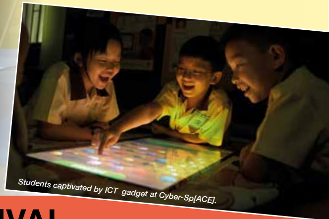
Students captivated by ICT gadget at Cyber-Sp[ACE].

Cyber-Sp[ACE] is a Cyber Wellness hub dedicated to advocate Cyber Wellness and to equip students with basic ICT skills. It is opened daily for students to learn more about Cyber Wellness principles such as respect for self and others during recess with electronic gadgets. Activities at Cyber-Sp[ACE] are managed and facilitated by Cyber Wellness Ambassadors and ICT monitors. The Cyber Wellness Ambassadors and ICT monitors play a crucial role in advocating good Cyber Wellness practices among their peers.