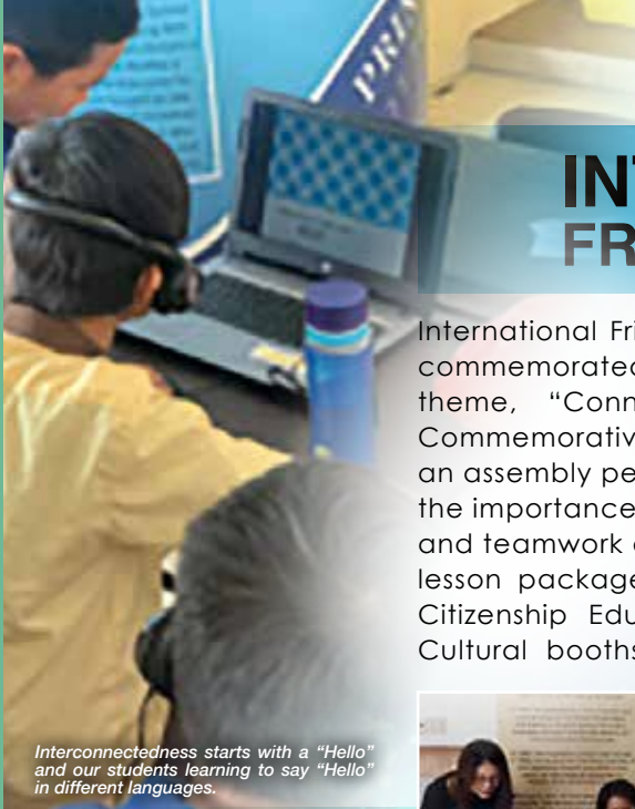
Interconnectedness starts with a "Hello" and our students learning to say "Hello" in different languages.

parent volunteers to provide an authentic 'international' experience for our students who had the opportunity to learn more about the cultures, traditions and languages of some of our ASEAN countries such as Myanmar, Vietnam and Nepal. Song dedications were made by students to thank their classmates and teachers for their friendship.