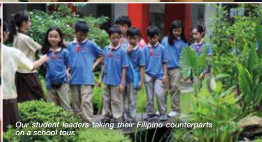
Our student leaders taking their Filipino counterparts on a school tour.