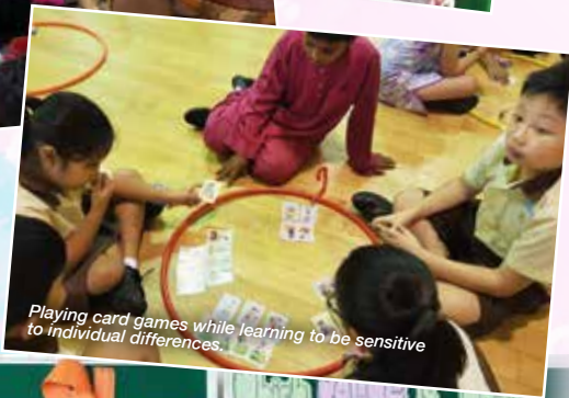
Playing card games while learning to be sensitive to individual differences.