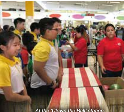
At the 'Clown the Ball' station.