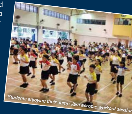
Students enjoying their Jump Jam aerobic workout session.

Through our Run for Life Programme, we hope that all students and teachers will reap not just physical, but also emotional and psychosocial benefits.