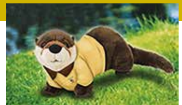
Our School Mascot, the adorable and friendly Otter.

improvement from their peers. Examples included the design of our school mascot, selection of songs for recess and snack break. In addition, our student leaders were also actively involved in crafting our Student Pledge which was recited at the end of each recess. The Student Pledge is a daily reminder for our students to stay committed to be a student of good character, respecting self and others and to learn together as one Bendemeer family.