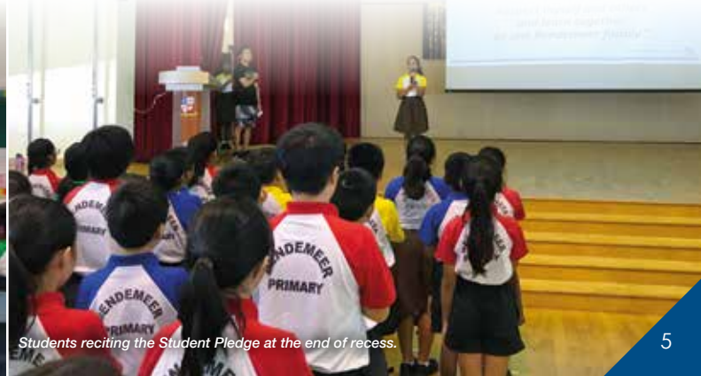
Students reciting the Student Pledge at the end of recess.