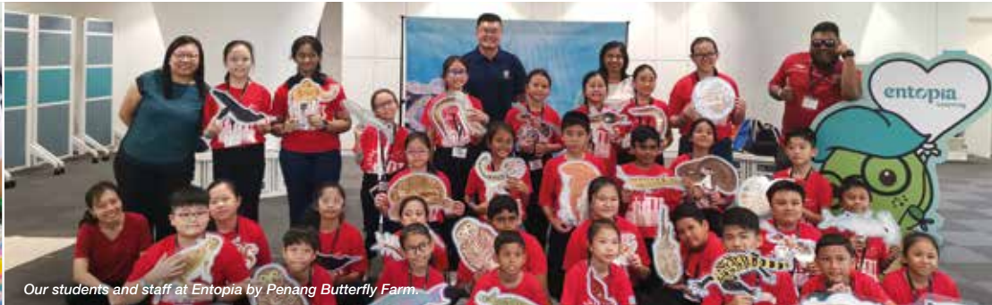
Our students and staff at Entopia by Penang Butterfly Farm.