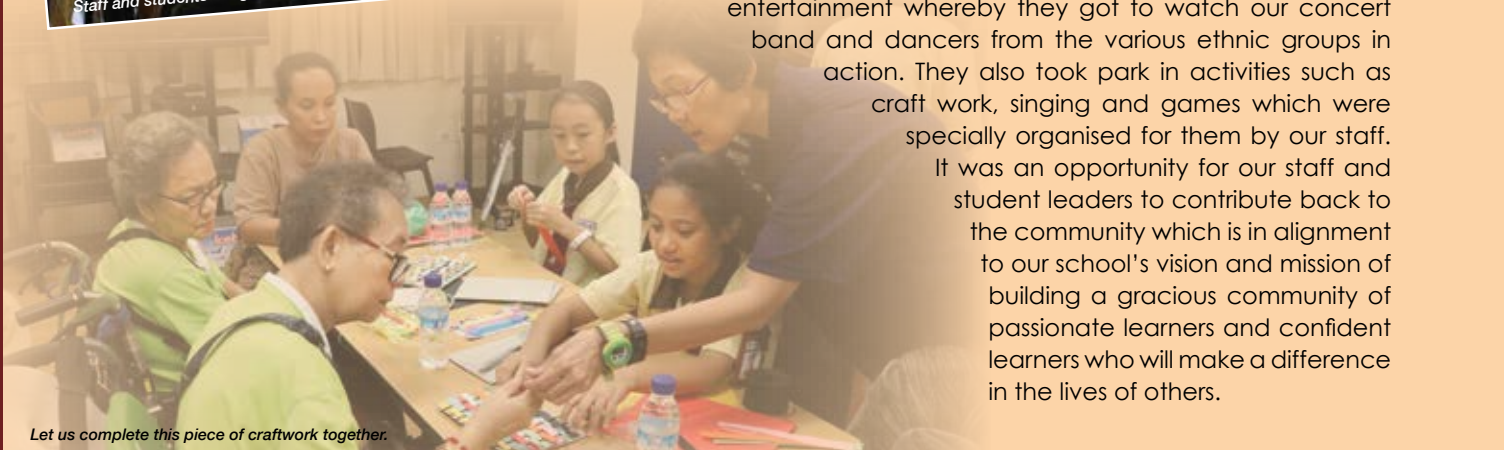
Let us complete this piece of craftwork together.

It was an opportunity for our staff and student leaders to contribute back to the community which is in alignment to our school's vision and mission of building a gracious community of passionate learners and confident learners who will make a difference in the lives of others.