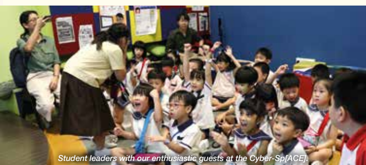
Student leaders with our enthusiastic guests at the Cyber-Sp[ACE].