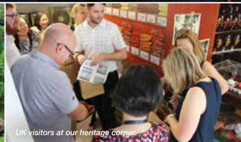
UK visitors at our heritage corner.