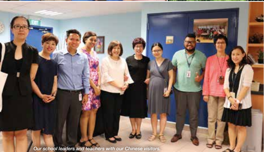
Our school leaders and teachers with our Chinese visitors.