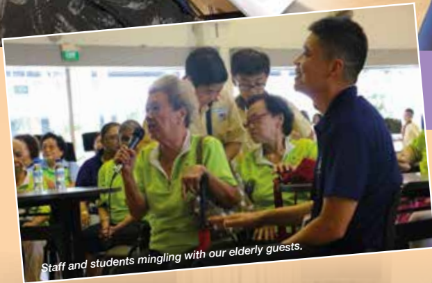
Staff and students mingling with our elderly guests.