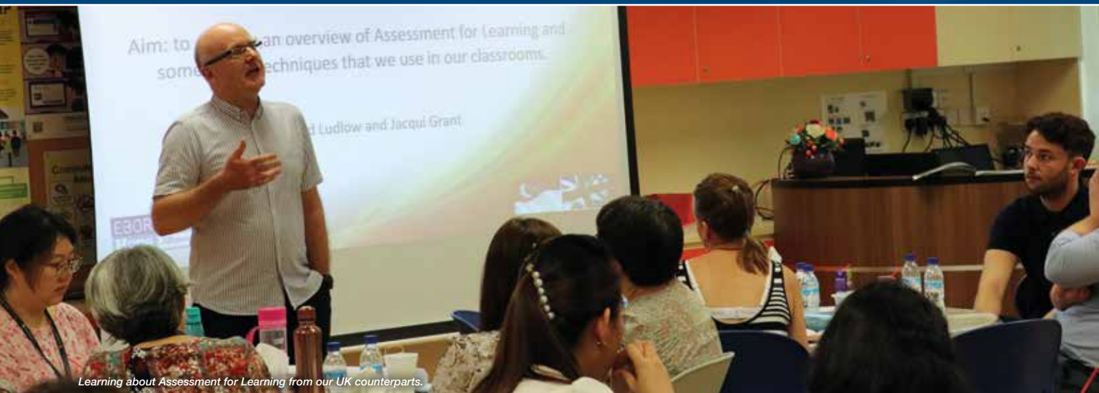
Learning about Assessment for Learning from our UK counterparts.