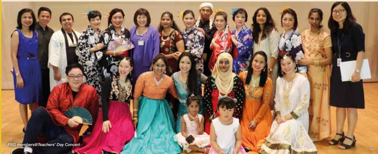
PSG members@Teachers' Day Concert

STRATEGIC THRUST 3: PARTNERSHIP WITH STAKE HOLDERS