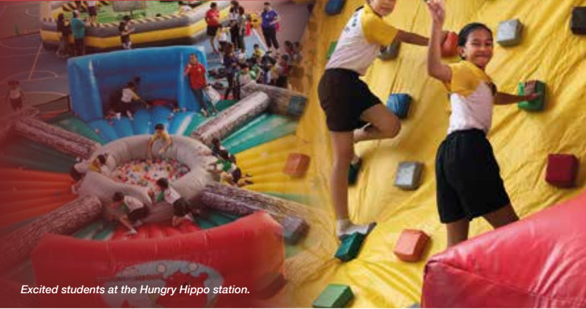
Excited students at the Hungry Hippo station.

This year, we celebrated Children's Day with a BANG! We brought in a carnival to the school and a magic show too! Our students were treated to an array of games like 'Ball the Clown', 'Colour-Matching' and 'Ring the Ball'. In addition, there were three huge bouncy inflatables which were the highlight of the event. Each student was also given a class photograph as this year's Children's Day gift. It was an occasion for our students to be gracious while they play. They were advised to queue up and wait patiently for their turn at every station and to cheer one another on. It was certainly a memorable event for all!