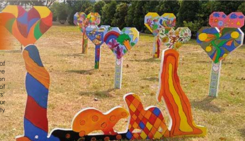
Our art work on display near Kallang MRT Station.

Our Art Club took part in the 'Garden of Hearts' project which was an initiative presented by the People's Association – Passion Arts in commemoration of Singapore's Bicentennial. Our students' and teachers' art work captured our hopes and dreams for our community and nation.