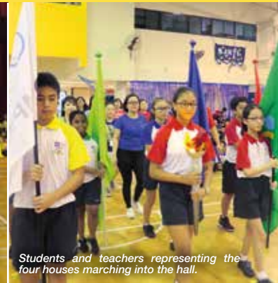
Students and teachers representing the four houses marching into the hall.