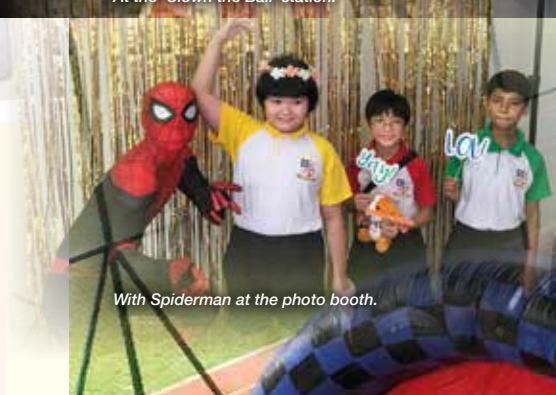
With Spiderman at the photo booth.