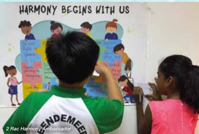
2 Rac Harmony Ambassador