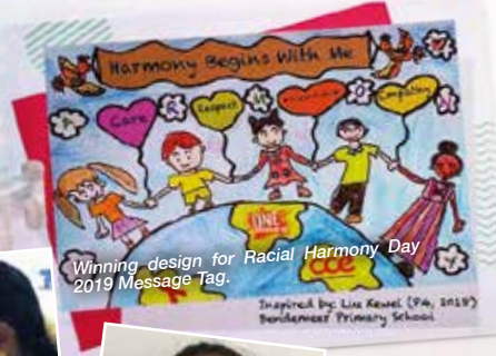
Winning design for Racial Harmony Day 2019 Message Tag.