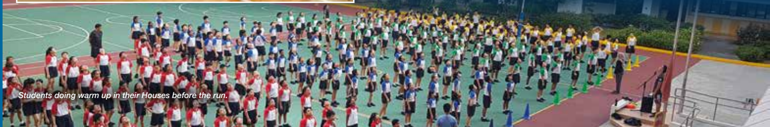
Students doing warm up in their Houses before the run.