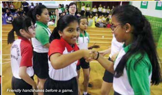
Friendly handshakes before a game.