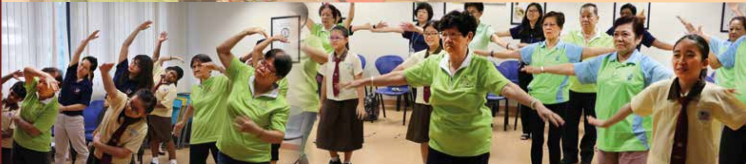
Exercise time for all!