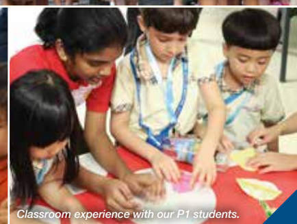
Classroom experience with our P1 students.