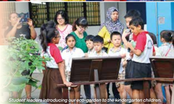
Student leaders introducing our eco-garden to the kindergarten children.

This year, a total of 275 children from 15 kindergartens visited our school together with their parents and teachers. Our student leaders were able to hone their leadership skills by leading their little charges on a school tour. Our excited guests also got to experience what it was like to be in a Primary 1 class.