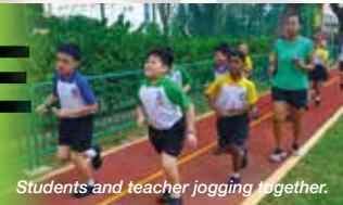
Students and teacher jogging together.

In line with the Ministry of Education's emphasis on nurturing lifelong learners to 'Learn for Life', our school started our Run for Life Programme this year. Through the weekly run, we hope that our students will be able to adopt a positive attitude towards running and choose running as a lifestyle choice. In addition, our students will also be able to acquire and maintain their health, enhancing fitness and as a result, enjoy and value the benefits of living a physically active and healthy life in the long run.