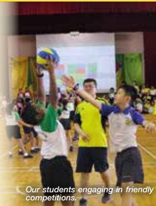
Our students engaging in friendly competitions.

This year's Annual Games Day took place on 5 July 2019 with students and teachers taking part in various games representing the four new houses. It provided a platform for our students to engage in friendly competitions and to exhibit our school values and the three core Olympic values of excellence, respect and friendship. Our students indeed played all games with passion, self-discipline and integrity. They abided by the rules and exhibited good sportsmanship by encouraging and cheering one another on. It was heartwarming to see our students put in great effort and aspire to do their best as they participated in all the gruelling games.