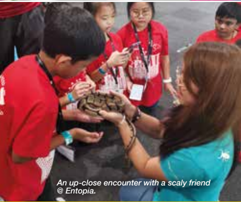
An up-close encounter with a scaly friend @ Entopia.