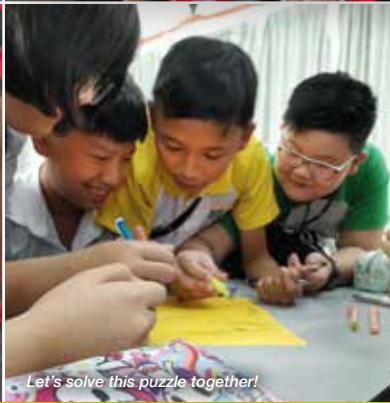
Let's solve this puzzle together!