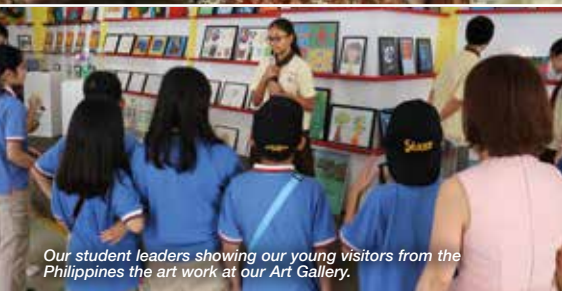
Our student leaders showing our young visitors from the Philippines the art work at our Art Gallery.