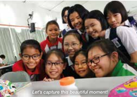
Let's capture this beautiful moment!

throughout the trip. Highlights included viewing the beautiful wall murals along the Penang alleys, being mesmerised by the animals at Penang Butterfly Farm, taking the Georgetown UNESCO Cultural and Art Walking tour, exploring the Peranakan Museum and Tropical Spice Farm and watching the Nonya Cultural Show. It was indeed a memorable overseas learning journey.