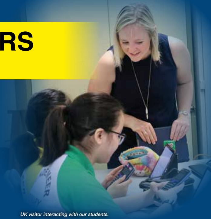
UK visitor interacting with our students.

Our student leaders played host to our visitors from the Philippines during the school visit. It was indeed an enriching experience for both our teachers and students.