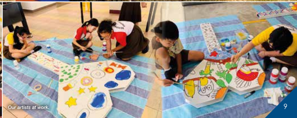
Our artists at work.