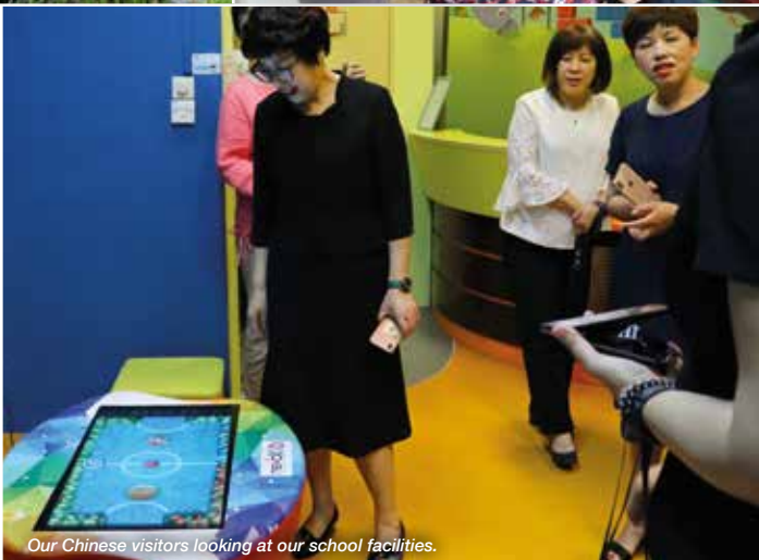
Our Chinese visitors looking at our school facilities.