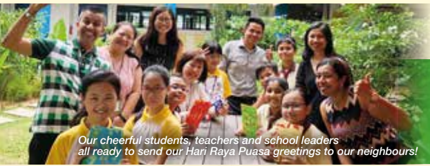
Our cheerful students, teachers and school leaders all ready to send our Hari Raya Puasa greetings to our neighbours!