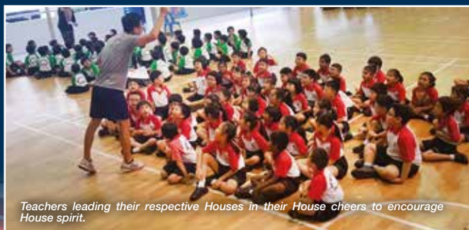
Teachers leading their respective Houses in their House cheers to encourage House spirit.

To make the Run for Life Programme more meaningful for all students and teachers, we have also started a 'Run to Tokyo' project, to simulate an Olympic torch relay starting with the lighting of the Olympic torch at Olympia, Greece, then to travel all the way to Singapore, where our school, Bendemeer Primary School is, and finally to bring the Olympic torch from Singapore to Tokyo, Japan, for the 2020 Tokyo Olympics Games, covering a total distance of about 14560km.