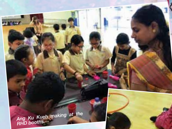
Ang Ku Kueh making at the RHD booths.