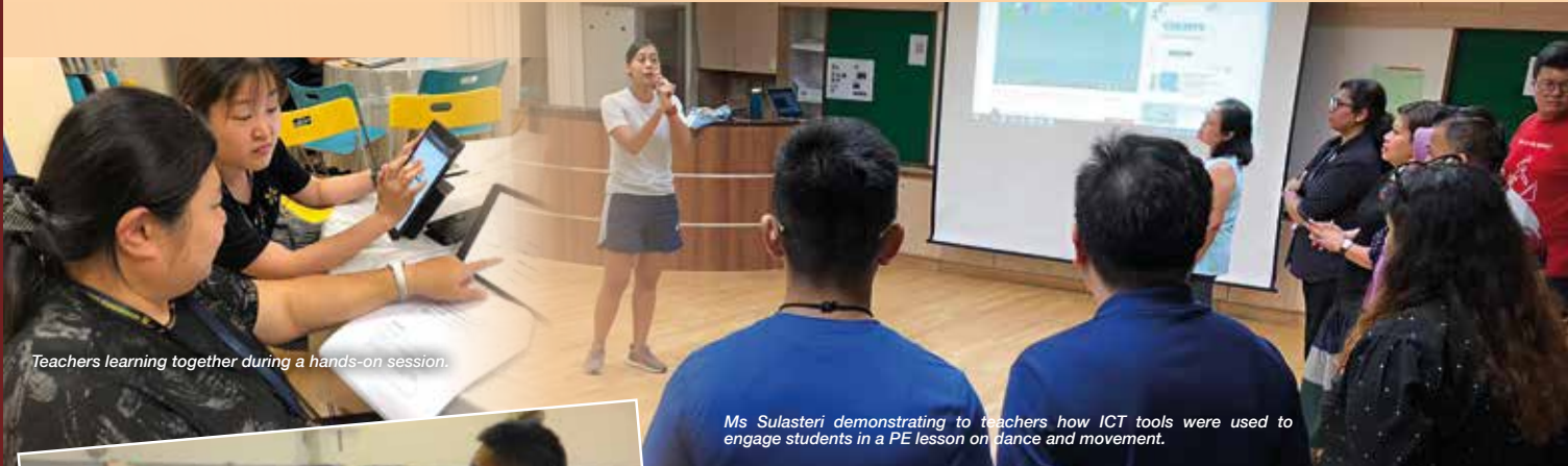
Teachers learning together during a hands-on session.