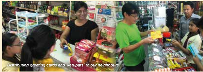
Distributing greeting cards and 'ketupats' to our neighbours.

On 27 May 2019, a group of our student leaders and teachers, accompanied by our school leaders, distributed Hari Raya Puasa greeting cards and 'ketupats' to the business operators in our neighbourhood. These festive gifts were specially prepared by our students during their Art lessons. This project not only allows us to extend our festive greetings to our friendly neighbours, it also helps to promote a sense of community and neighbourliness between our school and its community.