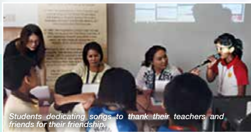
Students dedicating songs to thank their teachers and friends for their friendship.