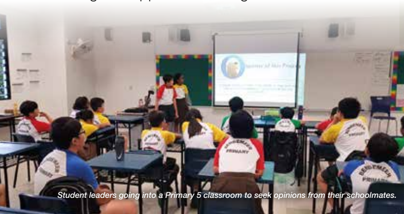
Student leaders going into a Primary 5 classroom to seek opinions from their schoolmates.