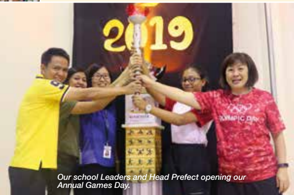
Our school Leaders and Head Prefect opening our Annual Games Day.