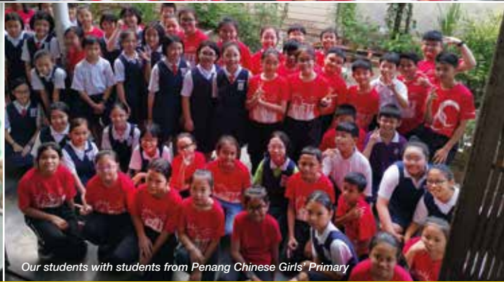
Our students with students from Penang Chinese Girls' Primary