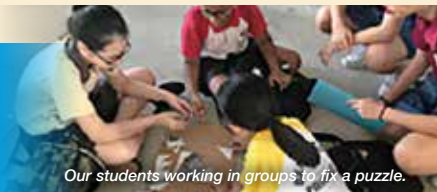
Our students working in groups to fix a puzzle.

Through this trail, our students gained a better understanding of the Kallang River and its roles in the community from past to present. Our students also learnt to appreciate this distinctive river as part of the Singapore Water Story, its features, purpose and our responsibilities to take good care of it.