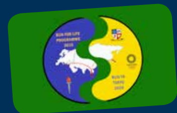
Design of 2-in-1 Collar Pin for Run to Tokyo Project