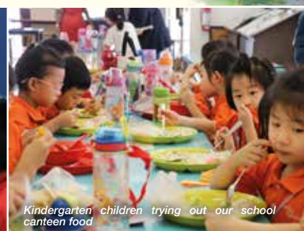
Kindergarten children trying out our school canteen food.