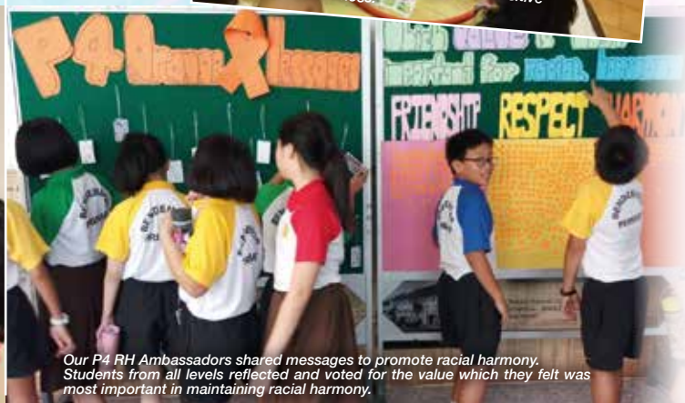
Our P4 RH Ambassadors shared messages to promote racial harmony. Students from all levels reflected and voted for the value which they felt was most important in maintaining racial harmony.